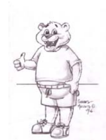
"Elbe": Park Mascot