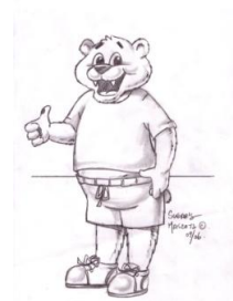
"Elbe": Park Mascot