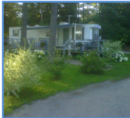
Trailer of Denise & Eldon LaCharity. Unfortunately, Denise & Eldon were unavailable for a photo at print time.