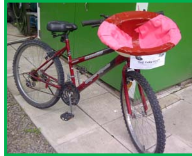
Official Park Post Delivery Vehicle Of The Park Liaison