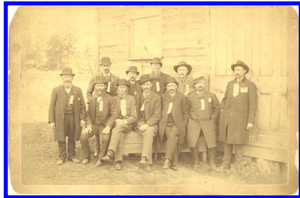
Photo: 1890 Board of Directors

Volunteers are needed to help with the planning and hosting of the upcoming events. Interested individuals are asked to contact the Fair Office at 613-928-2800 or via email to info@deltafair.com .