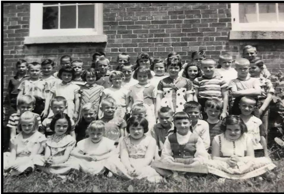
DELTA PUBLIC SCHOOL, 1960