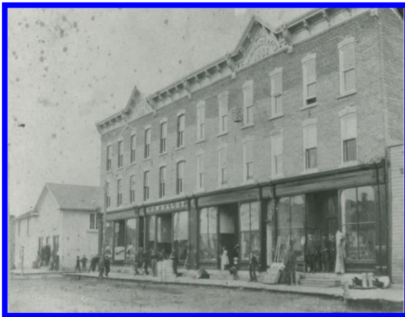
Photo: Singleton Block, 1890