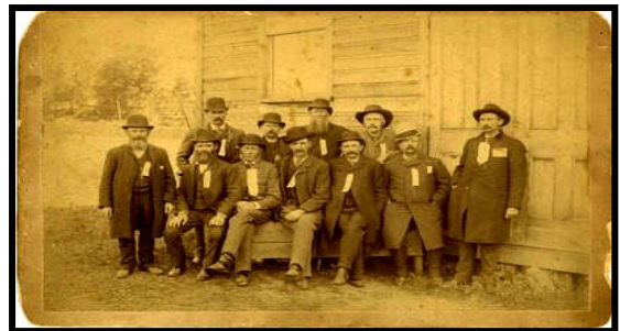
Delta Fair Board of Directors Circa 1890

Be part of planning the 2026 Maple Syrup Festival and Fair.