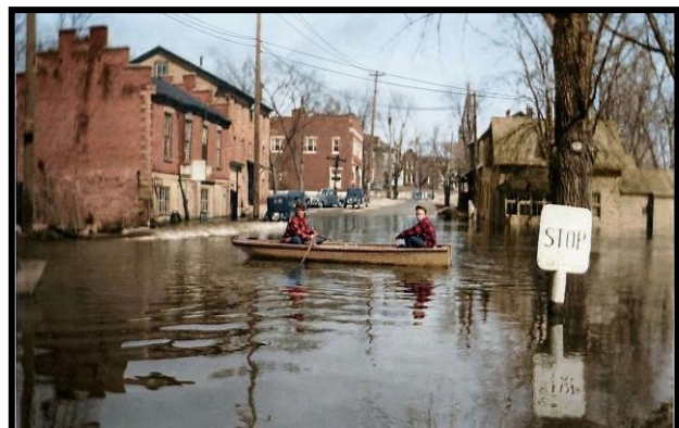
Flood of 1950