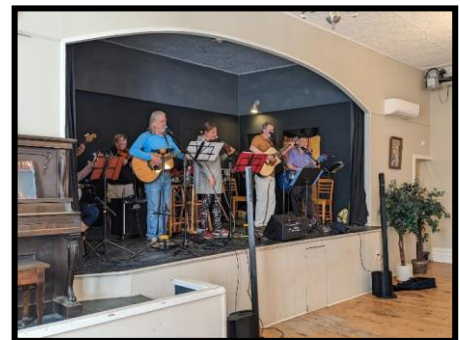
Mary’s Merry Minstrels

Details of the event will be added to the Society’s website events page as they become available.